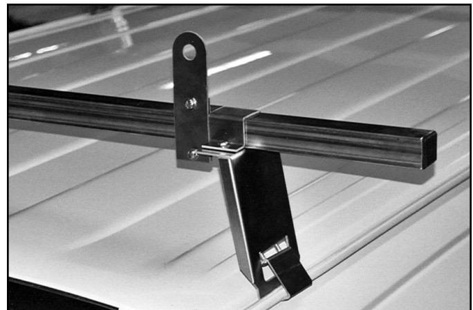
Photo of installed roof rack.

Caution: Some metal edges could be sharp; we recommend wearing gloves during installation.